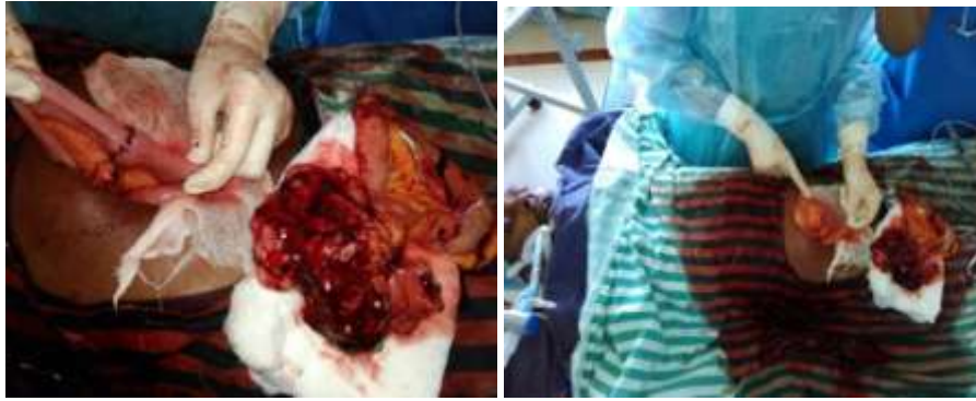
Resection and anastomosis